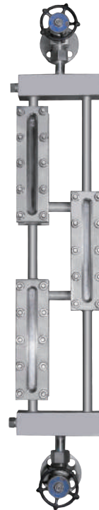
Model : L220 (Transparent type)